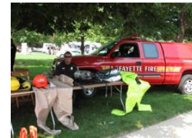
Homeland Security Career Fair

For information please visit our website at: www.purdue.edu/homelandsecurity