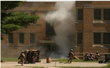
Training Exercise at Muscatatuck

Eta Sigma Iota is America's first and only Homeland Security Professional Society. Founded in 2006, from the Purdue Homeland Security Institute (PHSI) and the Purdue University Regional Visualization and Analytics Center (PURVAC), we are dedicated to bringing together students and faculty of Purdue University who are interested in issues related to the field of Homeland Security. Eta Sigma Iota fosters student and faculty involvement in homeland security, consequently developing exceptional leaders able to prepare for, respond to, and recover from emergency situations.